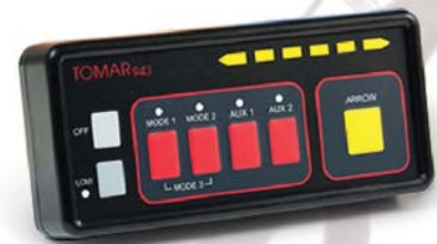
943-SB Controller Available Separately