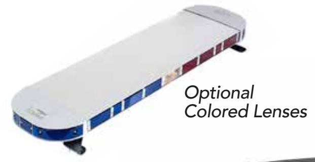
Optional Colored Lenses