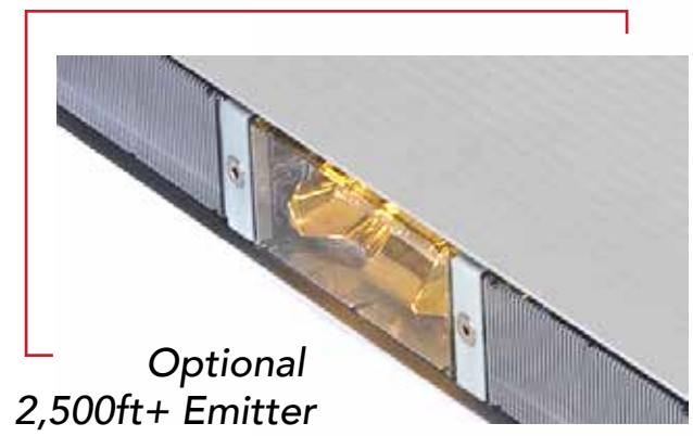
Optional 2,500ft+ Emitter